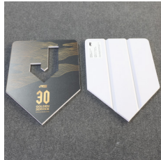
PVC foam board